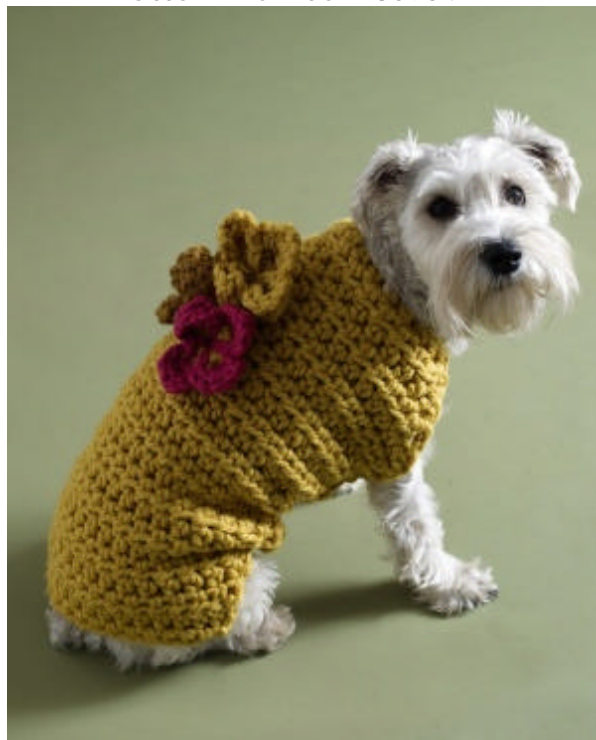
This cozy sweater will keep your puppy warm and happy.